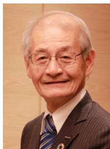
Dr. YOSHINO Akira, Director